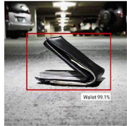
DROPPED OR FORGOTTEN OBJECTS DETECTION