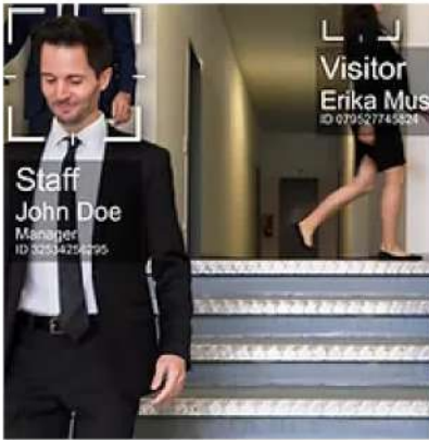
CLASSIFICATION (VIP, EMPLOYEES, BLACKLIST, CUSTOMERS)